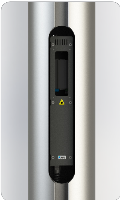
Shown inside pole (cover removed)