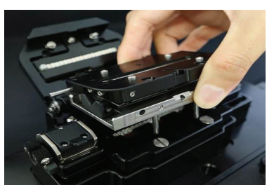
Easy mold, resin and pump exchange