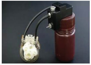
Spare Pump for quickly changing UV resin type: FSR-05-pump-01