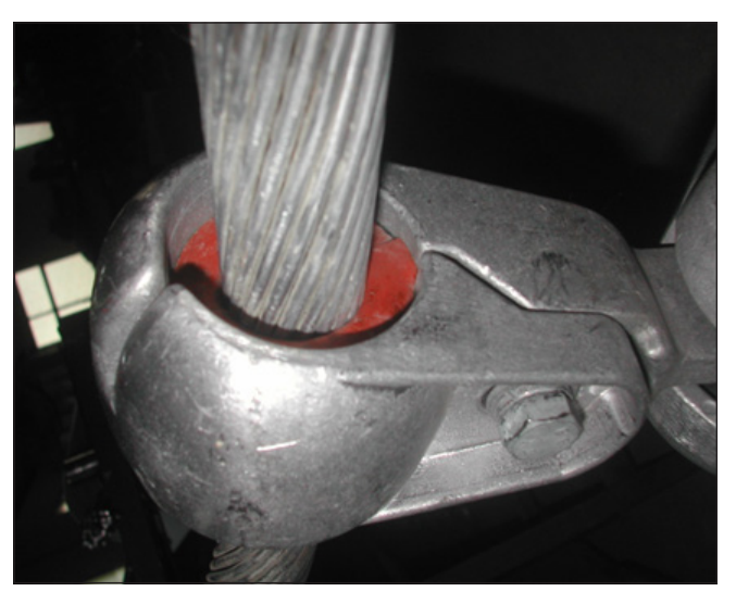
Each clamp of the Spacer Damper should look like this after installation.