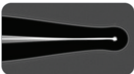
Tapered Probe with Small Ball End