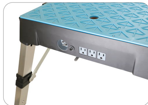
Mobile Splicing Workstation power strip