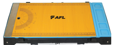
Mobile Splicing Workstation folded - work surface