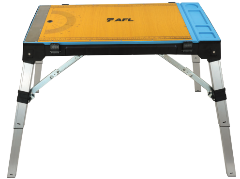
Mobile Splicing Workstation assembled

Maximize your splicer investment with the field solution that pays for itself on every job. AFL's Mobile Splicing Workstation represents AFL's commitment to innovation that addresses real-world challenges. By combining multiple functions in one premium solution, technicians can work faster, smarter, and more efficiently reducing setup time and increasing productivity on every job. Invest in the workstation that works as hard as you do.