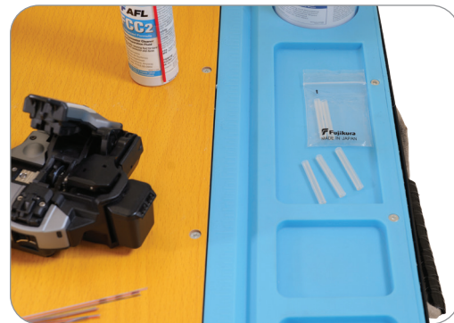
Mobile Splicing Workstation accessory storage