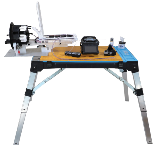
Mobile Splicing Workstation assembled with equipment (not included)