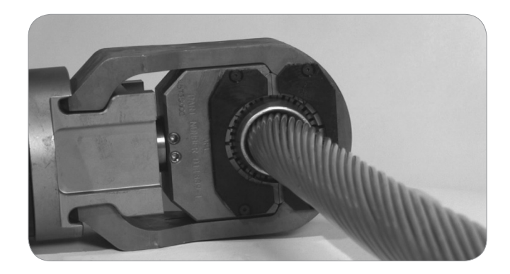
Fig. 4b—NOTE: Always properly position yourself to the Swage Press when compression is in progress. Keep clear of the press hose. SEE FIG. 6.