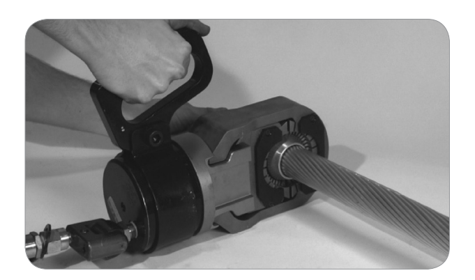
Fig. 4a—NOTE: Complete die closure is required on all compressions.

Using the correct 45TD or 65TD die set, listed in Table 1, assemble the power unit with the press head. Position the press perpendicular on the accessory as shown below in Fig. 4. Ensure the die teeth are in-line with the Swage lines on both sides. Compress the cable connector to 10,000 psi.