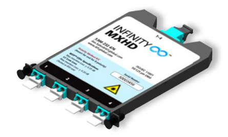
MXHD-4-108-LCAQ* MXHD MTPM-LC 8F OM4 Cassette