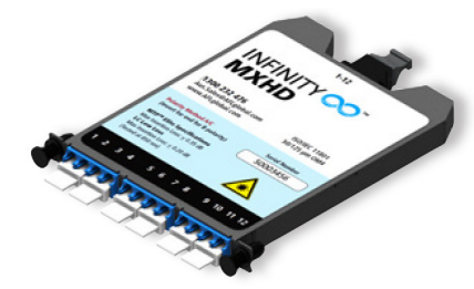
MXHD-1-112-LCBU MXHD MTPM-LC 12F SM Cassette