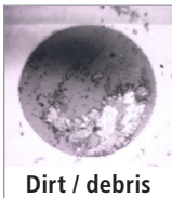
Dirt / debris