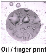
Oil / finger print