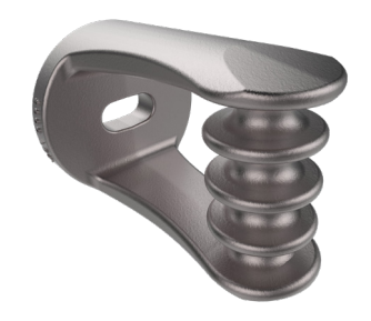
Multi-Drop Thimble Eye (ordered separately)