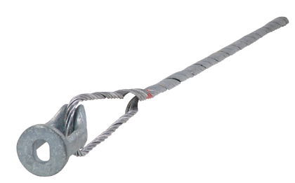
Drop Dead End shown with Single-Drop Thimble Eye