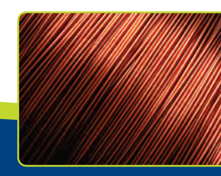
Fibre Passive Devices