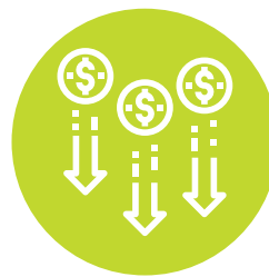
Lower Maintenance & Replacement Costs