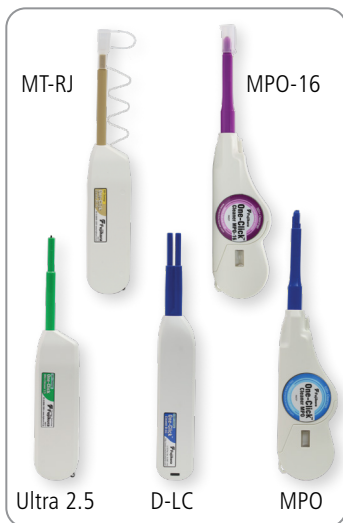
MT-RJ MPO-16 Ultra 2.5 D-LC MPO