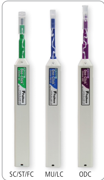
The Original One-Click Cleaner

The One-Click Cleaner features an easy one push action, which quickly and effectively cleans the end-face of connectors on jumpers or through adapters. The One-Click Cleaner uses the mechanical push action to advance an optical grade cleaning tape while the cleaning tip is rotated to ensure the fiber end-face is effectively, but gently cleaned.