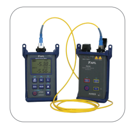
OPM5 Optical Power Meter and OLS4 Light Source