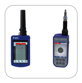
FOCIS Lightning®2 and FOCIS Flex Fiber Optic Connector Inspection System