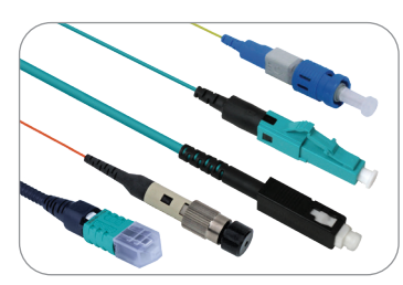
FUSEConnect® MPO, FC, SC, LC and ST Connectors