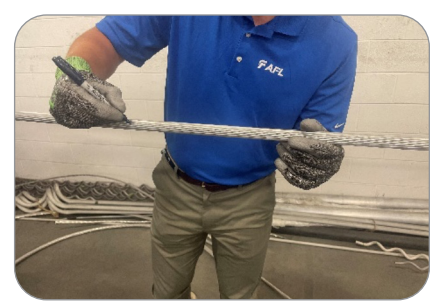
Figure 2 — Center mark application

1. Plumb and mark the OPGW or ADSS at the center of the attachment point using a felt maker or lumber crayon ( Figure 2 ). Do not scratch the cable.