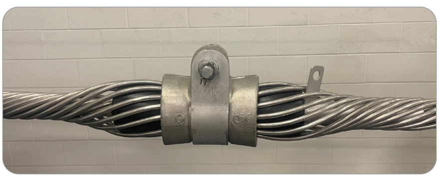
Figure 12 — Final assembly