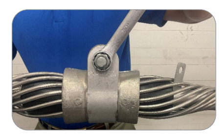
Figure 11 — Tightening bolt with wrench