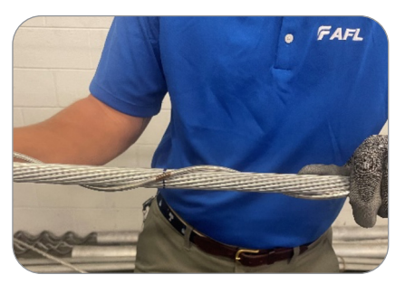
Figure 3 — Aligning first inner rod