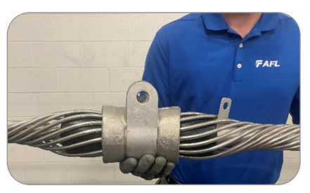
Figure 10 — Strap and housing applied