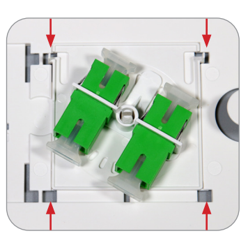
4 : All four (4) tabs are engaged and under the splice tray lock tabs.