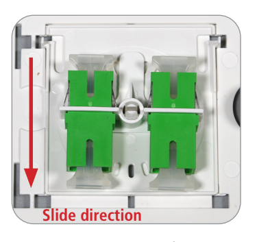
6: Then slide module out of retention slots.