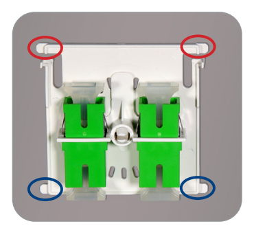
2: The reference tabs of the adapter module will be set in place where the blue circles are.