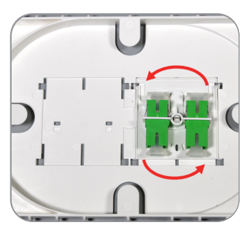
10: Rotate adapter frame 180 degrees (see Step 8) and the ferrules will meet off center and allow a larger boot on one side of the adapter frame.