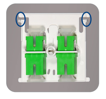
5: To remove adapter modules, simply pull back gently on locking tabs.