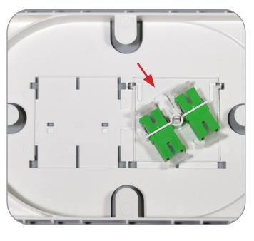
11: The module can be rotated in any position needed as long as the locking arm engages.