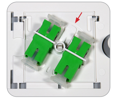
8: To rotate, simply lift the locking arm slightly to allow adapter frame to rotate and allow locking arm to re-engage in the desired position.