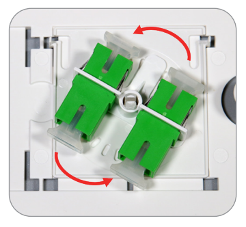
7: The modules may be rotated to provide the best bend radius for many applications.