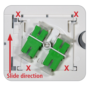
3: Align the four (4) tabs of module as shown to be locked into splice tray. Ensure all four (4) tabs are in place. Press down at the four X marks and slide forward to engage in the tray.