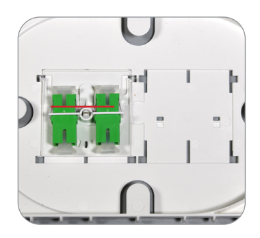
9: In this orientation, the ferrules meet in the center of the splice tray.