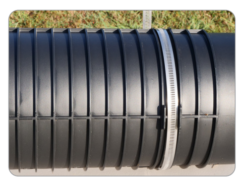
Figure 4 Figure 5 Figure 6