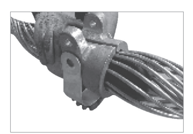
FIGURE 7: Place the housing around the "caged" insert

5.03 Apply the lock washer, bolt, nut and cotter pin to the bolt opening and tighten the bolt until the lock washer is collapsed. Final assembly shown in Figure 8 .