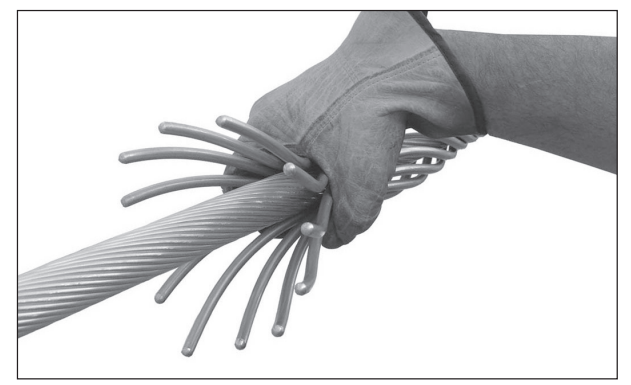
FIGURE 6: Wrapping the ends of the rods

4.05 Using firm hand pressures ONLY, wrap the ends of the rods in place, as shown in Figure 6 . Do not use a tool as it may scar or lead to damage.