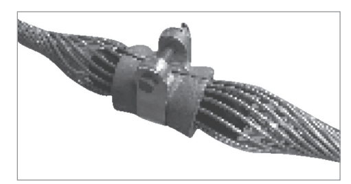
FIGURE 8: Final assembly