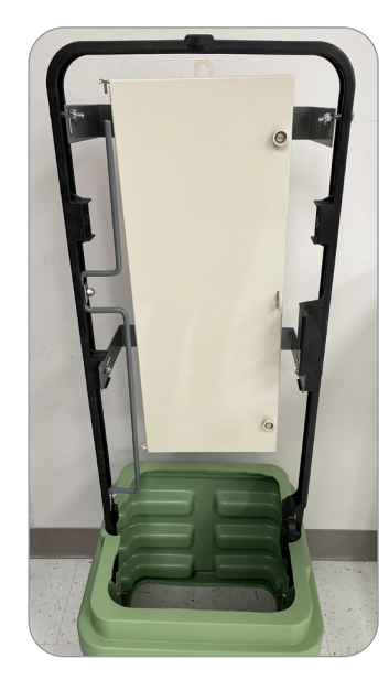
LL-400sx in OP1212

AFL's LL-400sx can be mounted into the Channell Optimus Pedestal (part number OP12126C1B1LH1A08, 12126 Dual Offset Brackets, light green Dual Cut pedestal) by moving the top mounting bracket prior to installation. This will allow mounting the LL-400sx using the pre-installed 10/32 inserts on the back of the enclosure using the (2) bolts included in the LL-400sx.