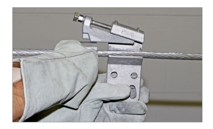
NOTE: Each interface is stamped with the smallest and largest conductor size in the range. Ensure that the interface is in the correct orientation prior to installing.

4. Use one hand to lift the pad tap connector so that the conductor sits in the groove of the C-body. Using the other hand, slide the interface between the conductor and the wedge.