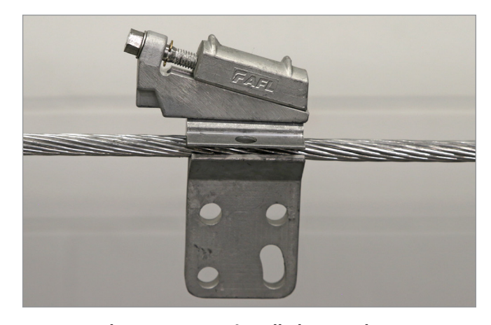
Pad Tap Connector installed on conductor.