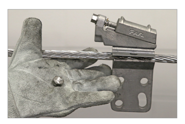
Breakaway bolt head sheared off.