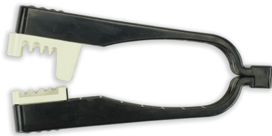
Cord Splitter Tool