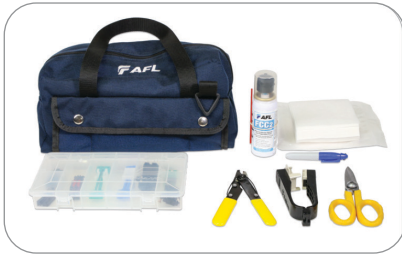
FUSEConnect Tool Kit Contents