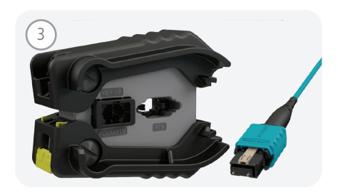
Remove the MTP® PRO Connector from the Polarity Change Port. Verify completion of polarity change.