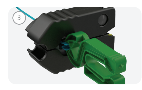
Slide Gripper onto the Pin Exchanger so that it is bottomed and centered. Compress the black MTP® PRO Field Tool handles.