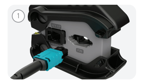
Insert pinned MTP® PRO Connector in the Pin Change Port until audible "CLICK". Do not compress the black handles.