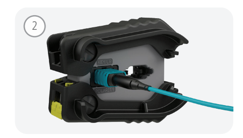
Insert the MTP® PRO Connector in the Polarity Change Port until audible "CLICK".