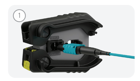
Align key on the MTP® PRO Connector with "KEY UP" on the Polarity Change Port.