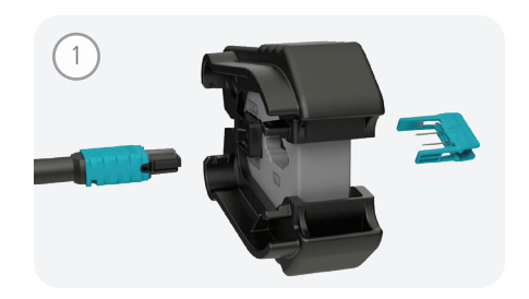
Insert unpinned MTP® PRO Connector in the Pin Change Port until audible "CLICK". Do not compress the black handles during pin insertion.