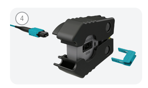
Pull out Pin Exchanger and verify insertion of the pins onto the MTP® PRO connector.