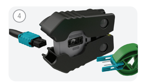
Compress the green Gripper handles until they touch and pull the Pin Exchanger out. Verify removal of pins.