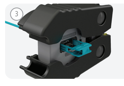
Insert Pin Exchanger into the opposite end of the Pin Change Port until audible "CLICK".