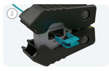
Align and insert Pin Exchanger on the opposite end of the Pin Change Port until it bottoms.