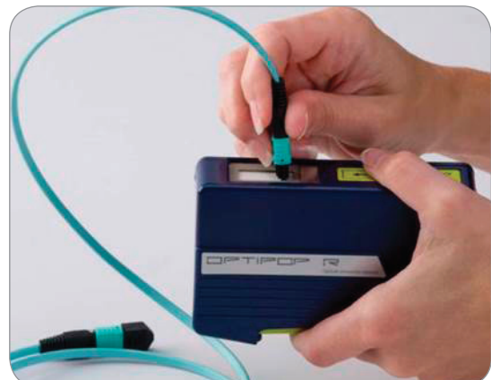
Image 2: OPTIPOP-R3 Refillable Cassette Cleaner for MPO/MTP Connectors