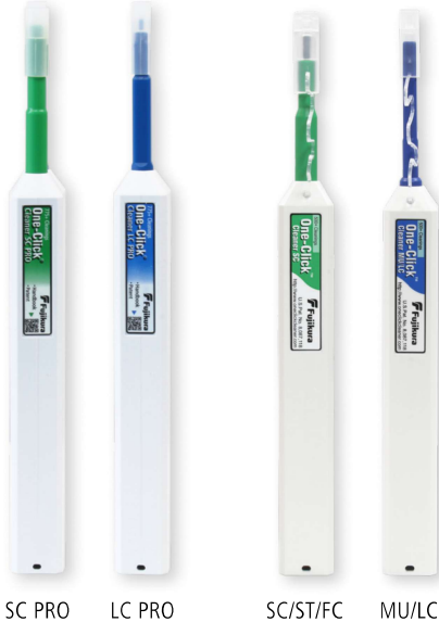
SC PRO LC PRO SC/ST/FC MU/LC

One-Click Cleaner D-LC (Duplex LC) - The One-Click Cleaner D-LC cuts cleaning time in half by effectively cleaning both connectors of a duplex LC connector simultaneously. Available in a long-lasting 500+ clean pen shape.