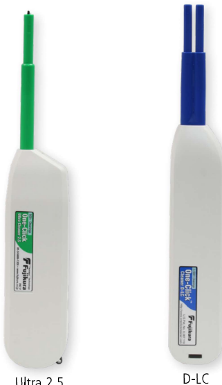
Ultra 2.5 D-LC