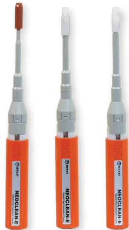
NEOCLEAN-E Models (E1, E2, E3)