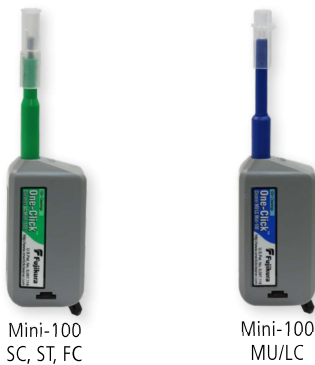
Mini-100 SC, ST, FC Mini-100 MU/LC