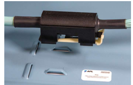
Integrated mounting clip