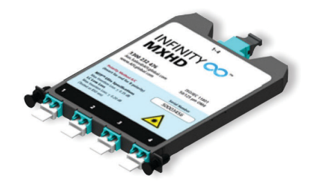
MXHD-4-108-LCAQ* MXHD MTPM-LC 8F OM4 Cassette